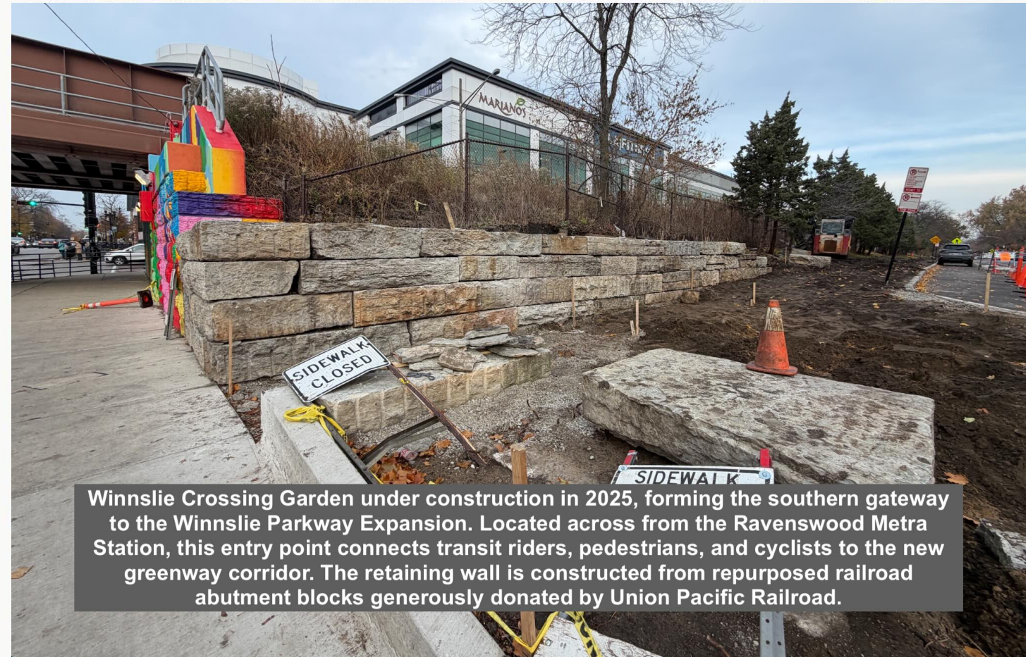
Winnslie Crossing Garden: Forming the southern gateway, featuring a retaining wall built from repurposed railroad abutment blocks.