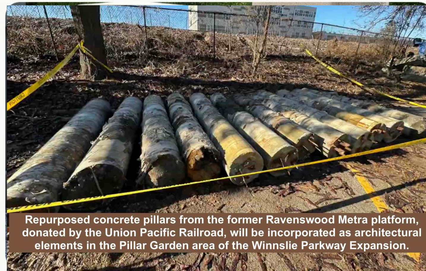
Repurposed Materials: Concrete pillars from the former Metra platform, donated by Union Pacific, serve as architectural elements.