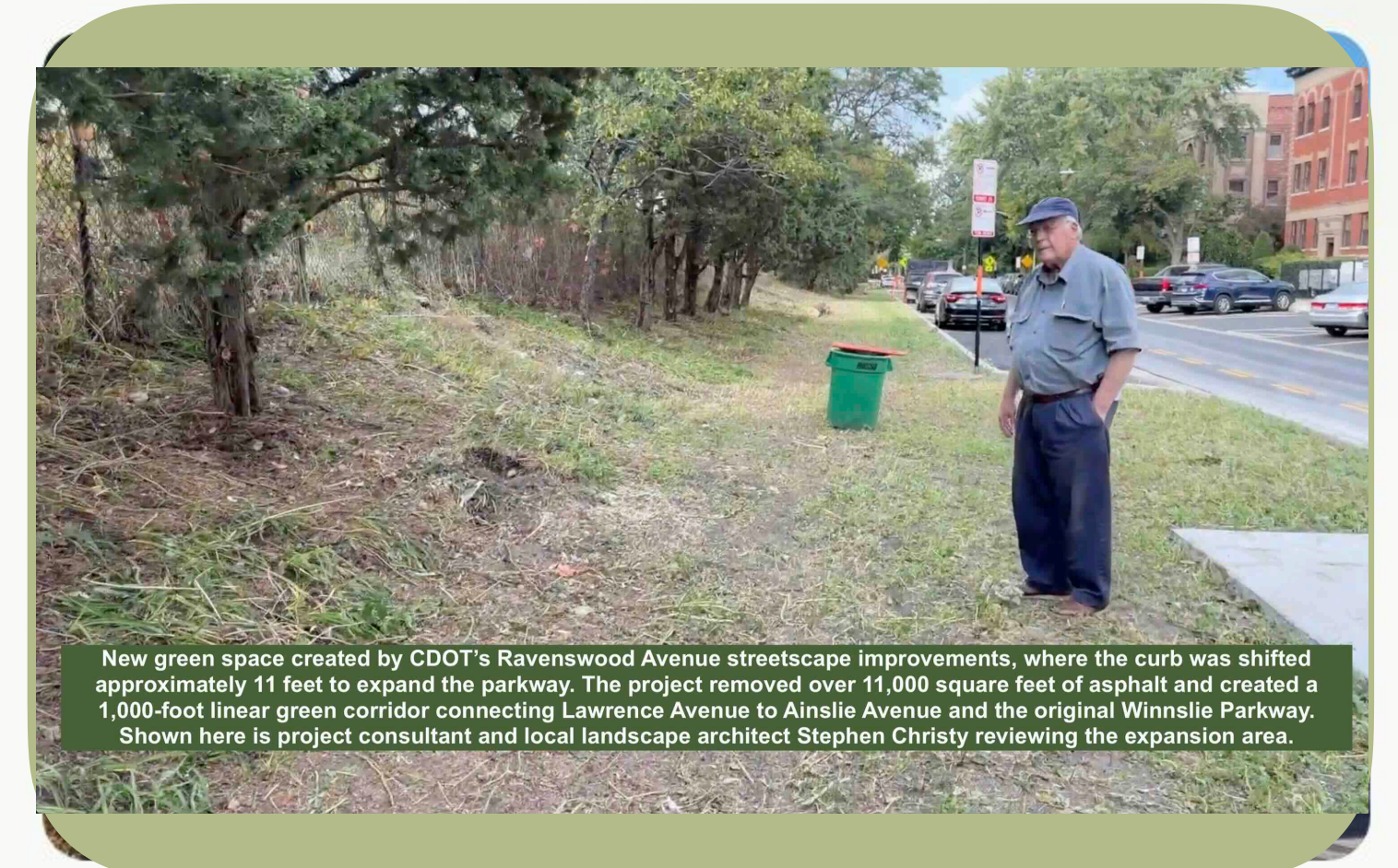
Streetscape Framework: CDOT's infrastructure work removed 11,000 sq. ft. of asphalt to create a 1,000-foot linear green corridor.